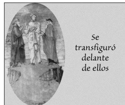
Se transfiguró delante de ellos

Si desea recibir un sumario de sus contribuciones del año 2014, hable a la oficina al 399-8800 o envíe un mensaje a julie.winkler@stmikecdom.org .