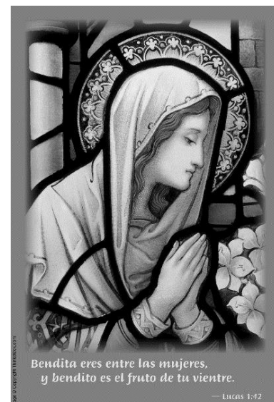
Bendita eres entre las mujeres, y bendito es el fruto de tu vientre.

La segunda colecta en todas las misas de Navidad será para Villa Vianney , la residencia para sacerdotes jubilados de nuestra Diócesis.